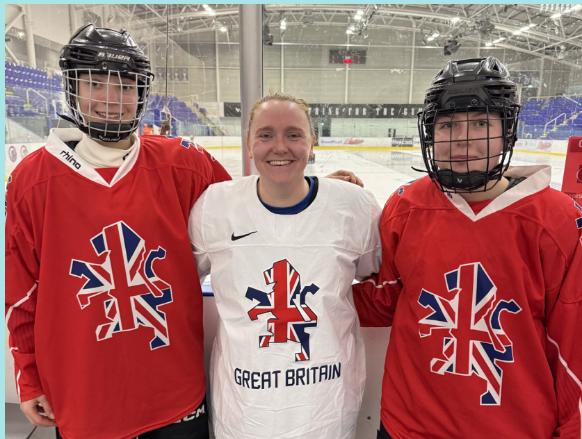
Great Britain Ice Hockey camp

Whitley Bay High School Deneholm Whitley Bay NE25 9AS 0191 7317070 www.whitleybayhighschool.org