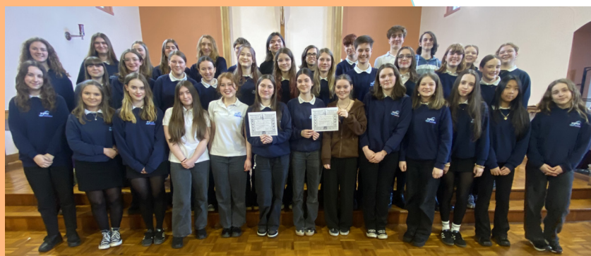
The Choir at Ryton Music Festival