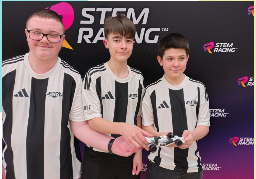
STEM Racing Regional Finals