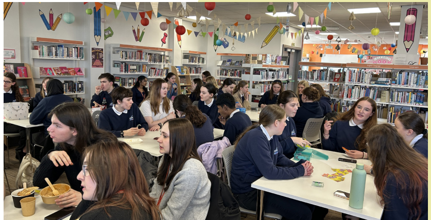
World Book day Quiz