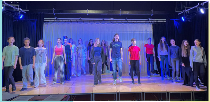
Performing Arts Rehearsal