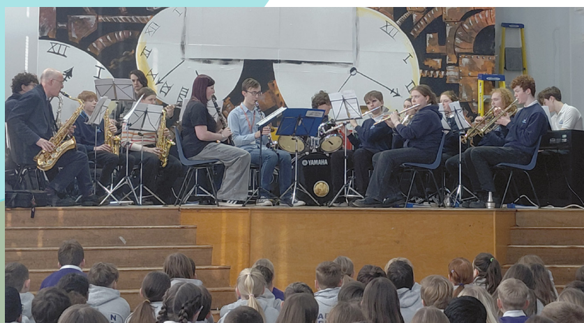
Jazz Band On Tour